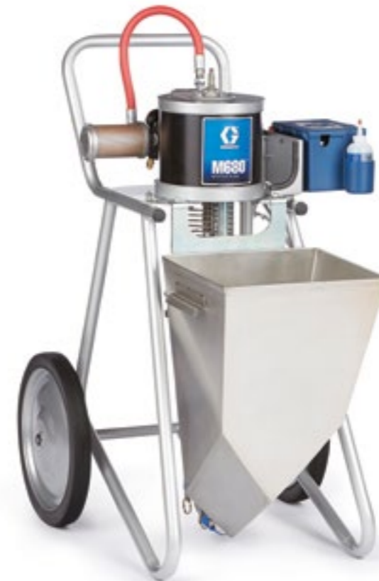
ToughTek M680a CS

The ToughTek M680a piston pump handles abrasive materials such as epoxy mortars, non-skid coatings (bridges and marine industry – solvent based coatings) or cementitious materials, and tackles difficult polymers with fillers such as glass flake, silica or sand. The all stainless design makes cleanup of epoxy mortars easy and worry-free.